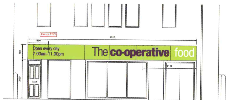
ELEVATION 1 - SIGN A 393mm M5 letters SCALE 1:50